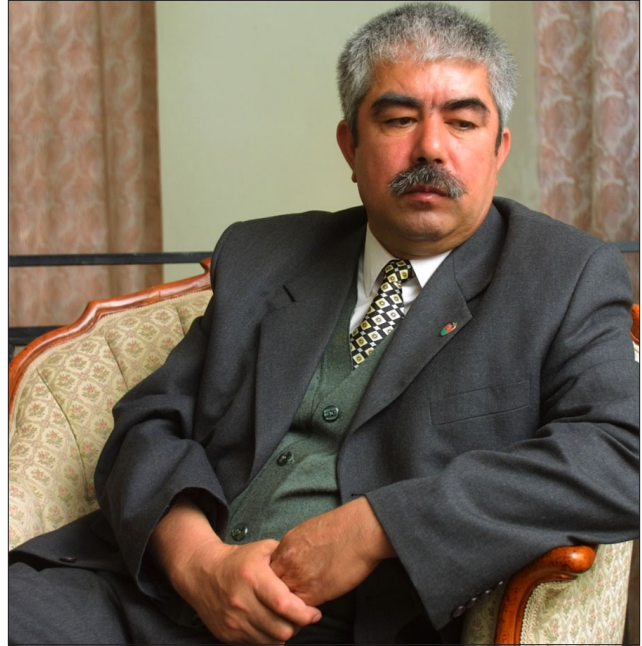
General Abdul Rashid Dostum

(SBU) The terrorist use of disguises can also be an effective tool to collect intelligence for target planning. Disguises enable the surveillant to blend into their surroundings without arousing suspicion -- a critical factor during the preoperational surveillance phase. It is at this stage that the terrorist is most vulnerable by exposing himself to the target prior to the attack. Posing as a beggar offers the surveillant a number of advantages that other ruses do not. Firstly, begging is universal and their behavior normally does not raise a red flag. In fact, people go out of their way to avoid them. Even law enforcement personnel view beggars as a nuisance, and do not perceive them as a threat. By making them “invisible” the “beggar” can case a target without being scrutinized. It also makes it more difficult to identify and/or describe them later on. Secondly, the nature of begging provides the surveillant with the flexibility to conduct both mobile and static surveillance. Thirdly, most beggars are prevalent in urban areas -- as are our diplomatic facilities.